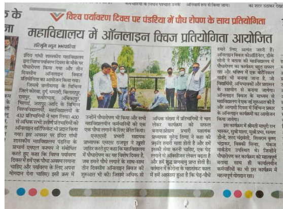
Pic :- Tree plantation event conduct by institution on the occasion of “World Enviornment day”.